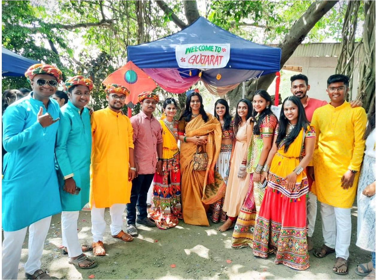
Fancy Dress Competition