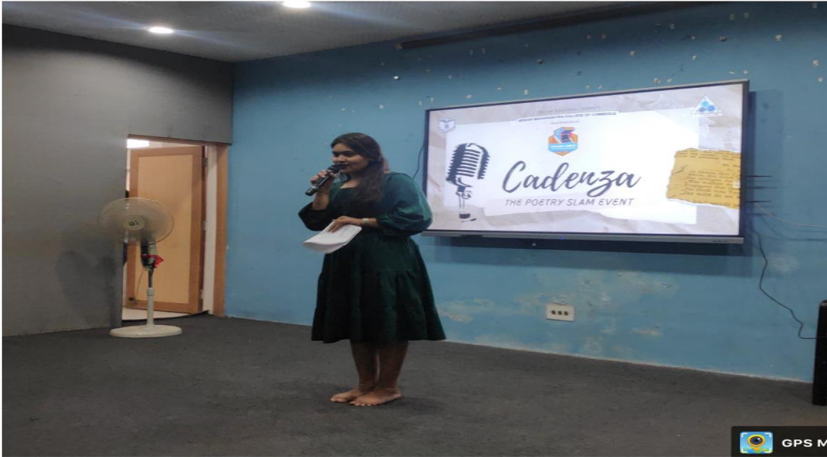
Poetry Competition Event