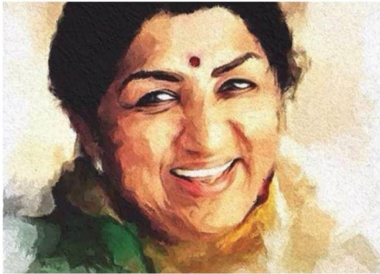
BHARATRATNA LATA MANGESHKAR