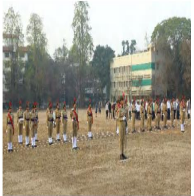
Republic Day Celebration