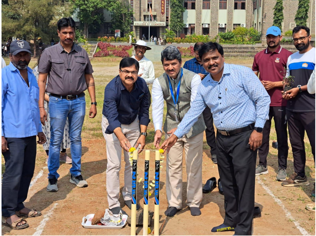
Basket Ball Match